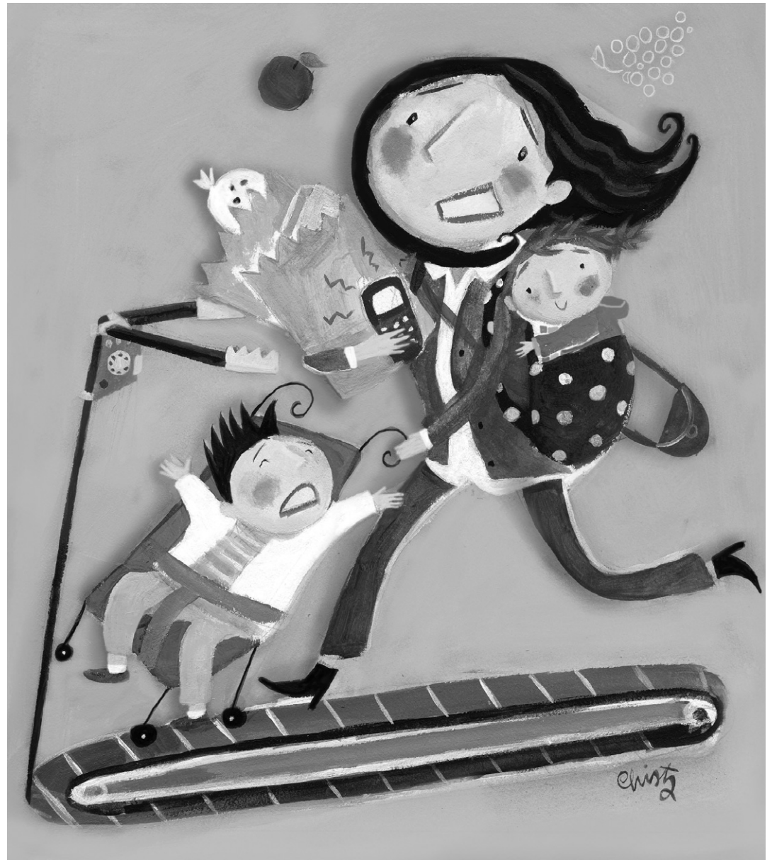
Illustration By Jana Christy

Why are parents today so overly anxious?